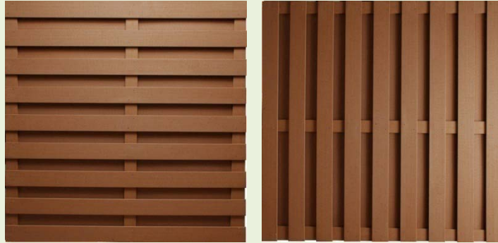
Medium Brown 180x180cm

The durable alternative to hardwood garden fences